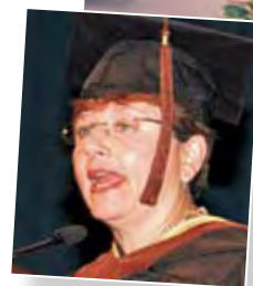
Irvine Mayor Beth Krom addresses class of 2006