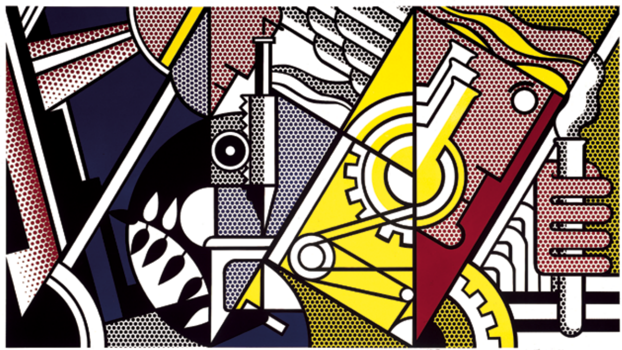
Lichtenstein's color lithograph graces a hallway in the Dean's Office.